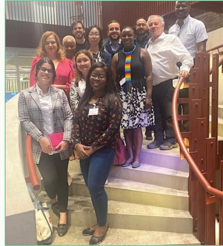
Workshop Participants of the Harvard Global Scholars Academy at CEU Budapest

Psychiatry seminars in graduate courses at Semmelweis University in Hungarian and English programs