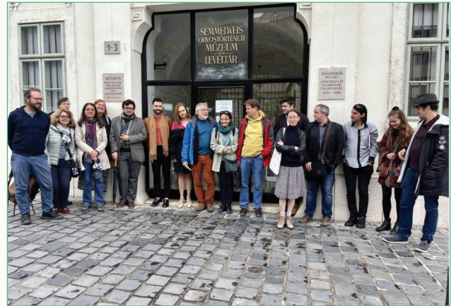
Leviathan workshop participants in Budapest