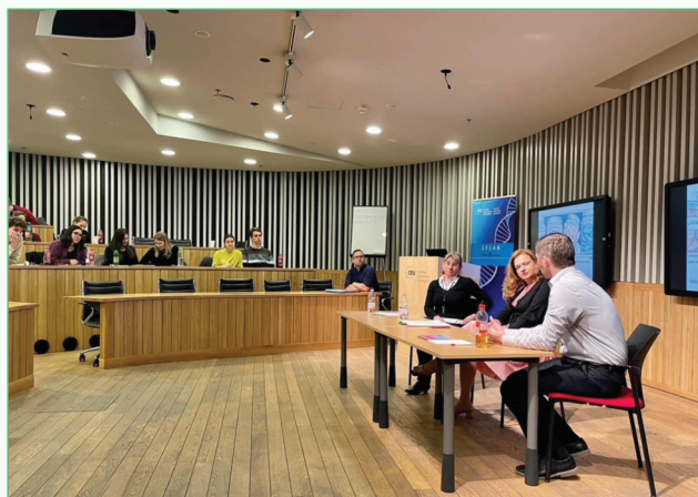
UniStem Day 2022

On March 18, 2022 CELAB held the annual UniStem Day at the CEU Budapest campus with the active participation of students from various secondary schools. UniStem is the Centre for Stem Cell Research at the University of Milan, Italy, founded in