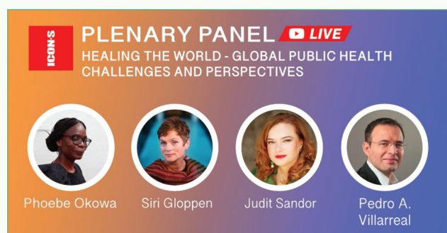
ICON-s Plenary Panel Poster

The ICON-s Conference on Global Problems and Prospects in Public Law is one of the most important public law events every year. Featuring plenary sessions, concurrent panels, interest groups, workshops and social events, it brings together scholars